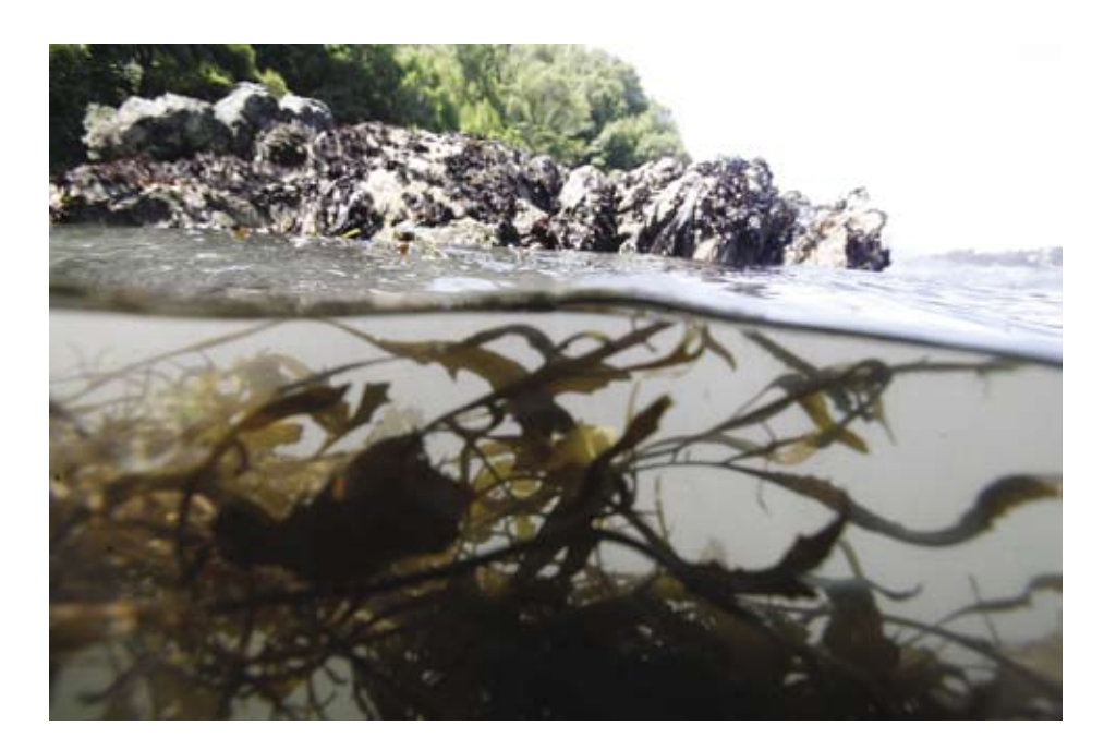
Feather boa kelp on the shores of Angel Island.

locations. The distributions and local abundances of macroalgae likely vary as these influences vary.